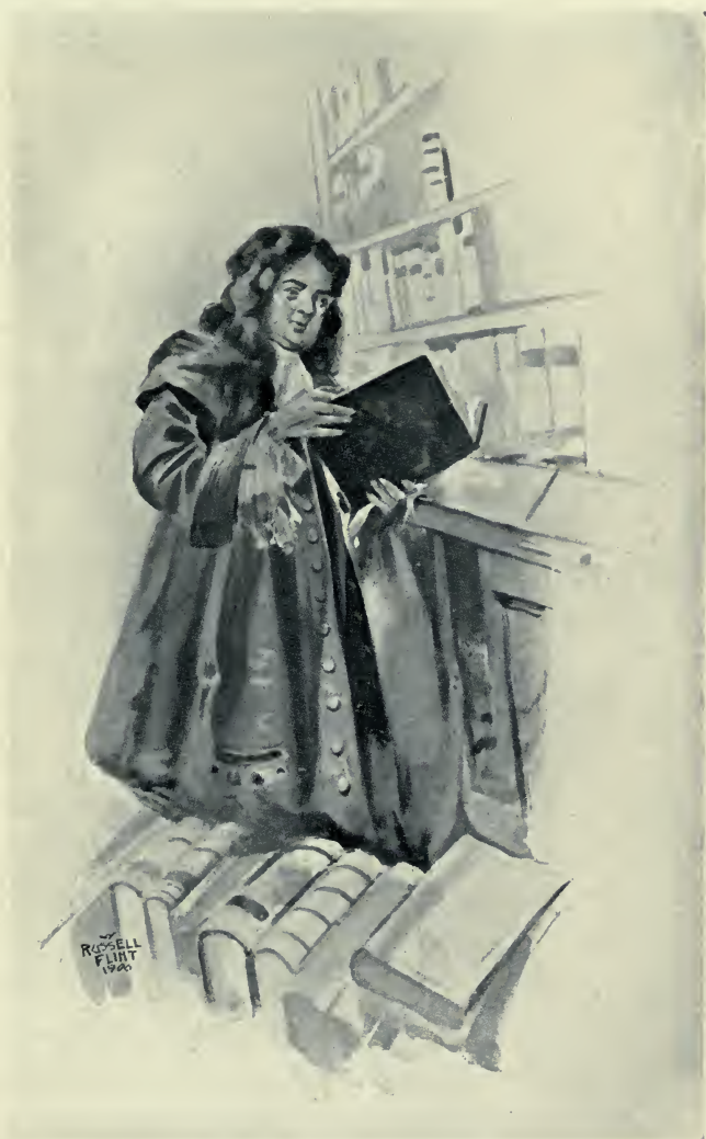
"PEPYS, A RIPE SCHOLAR WHO ACCUMULATED 3000 VOLUMES."